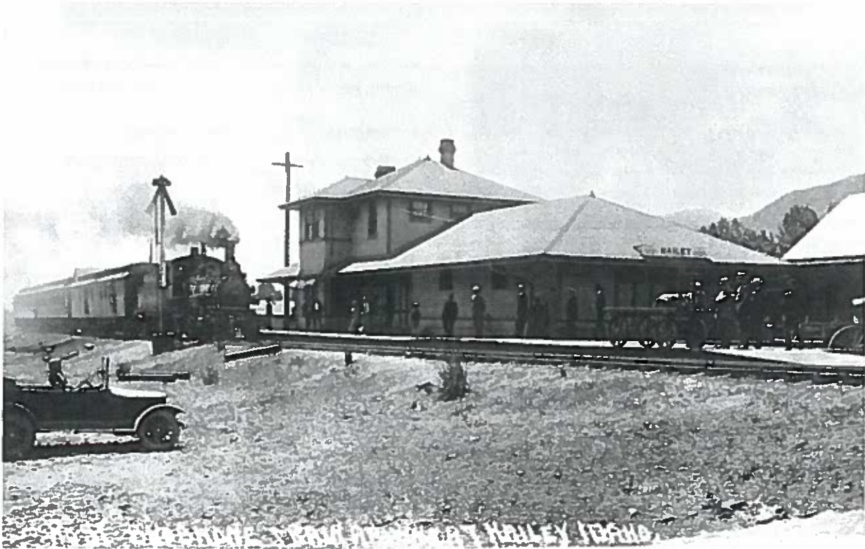
Shoshone Train Arriving at the Hailey Station: Photo Credit- The Community Library Center for Regional History