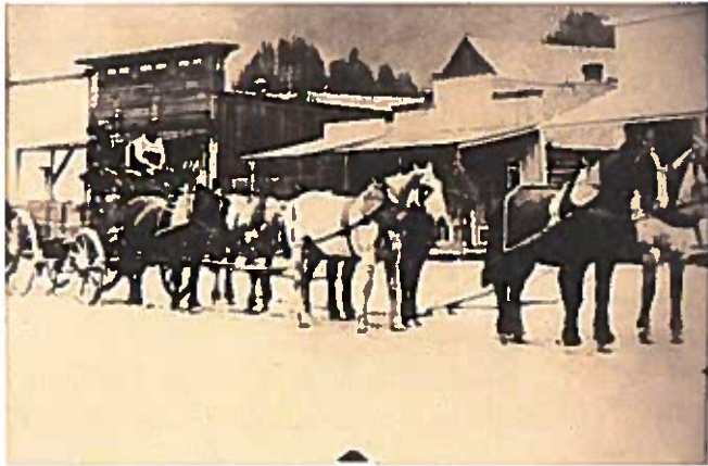
Hauling from the Minnie Moore Mine (Bellevue)

Several archaeological sites/historic sites potentially eligible either individually and/or part of a historic district: