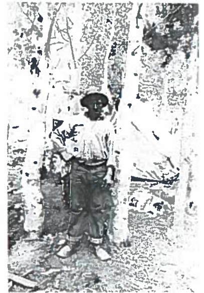
Basque Sheepherder somewhere outside of Hailey