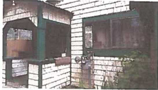
Front- Main House/Meter