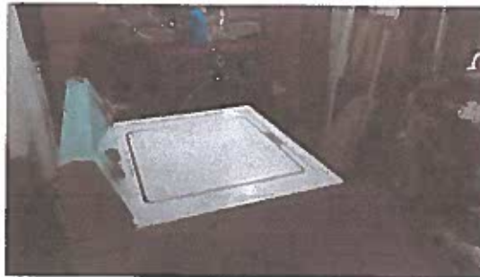
Laundry- Main House