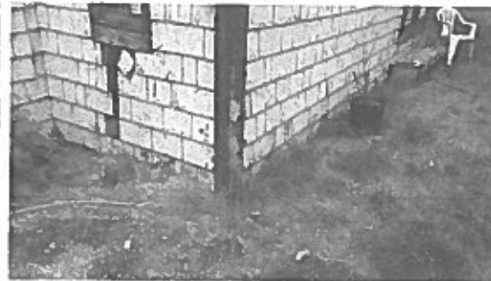
N. EAST INDENT Dirt to Wood