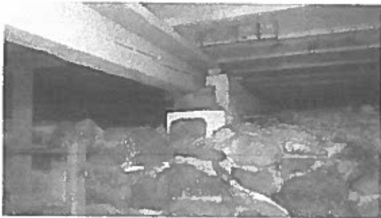
Crawl Space-Main House