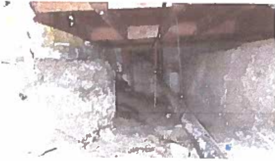
Guest House- Crawl Space