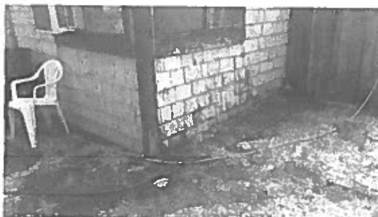
WEST SIDE Dirt to Wood/Peeling Paint