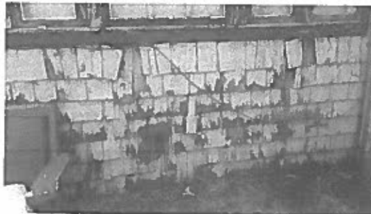
WEST SIDE Damaged Siding/Peeling Paint