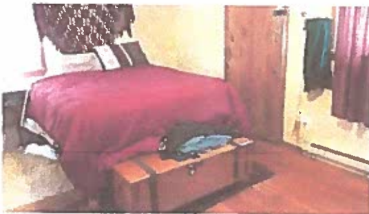
Bedroom- Main House