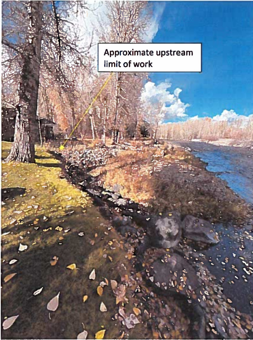
Legacy riprap to be vegetated.