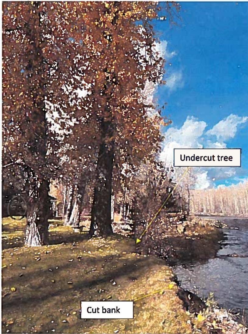
Looking upstream at cut bank and undercut cottonwood tree