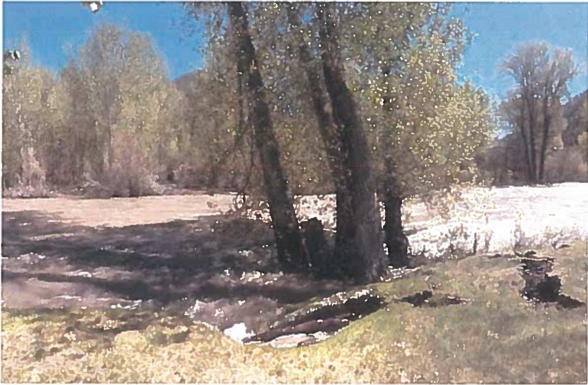
Flood conditions on May 10, 2017. Flow is left to right, bank erosion and development of scour hole at cottonwood tree is evident.