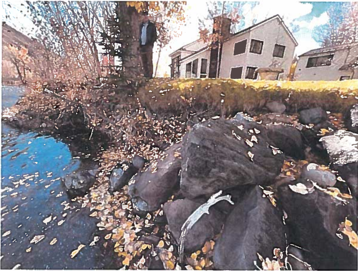
Looking upstream at severe bank undercut at tree. Upstream end of legacy riprap visible in foreground.