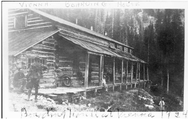
Vienna Mine Boarding House: Photo credit- The Community Library Center for Regional History