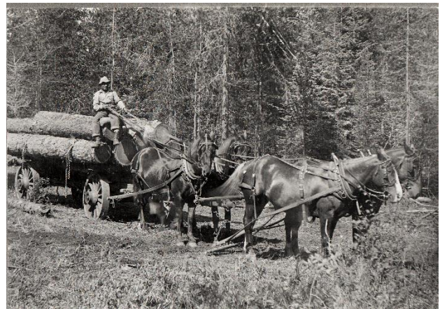
Horse Team Hauling Logs at the Sawtooth Mine