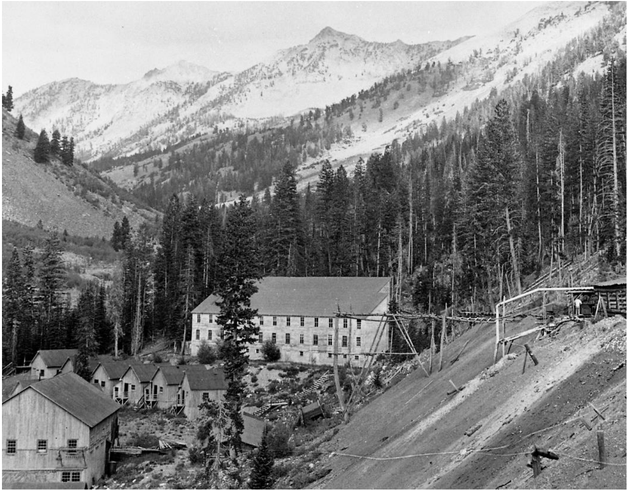
Mining at Sawtooth City